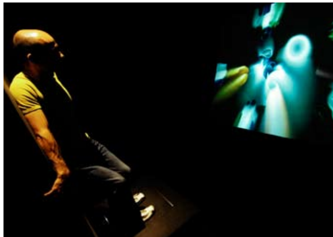
The Transmute Collective